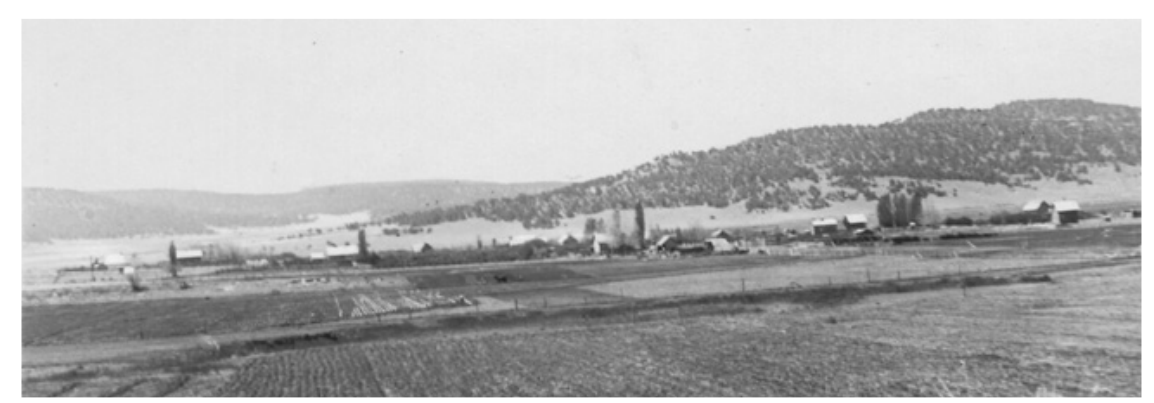
The small town of Ramah NM